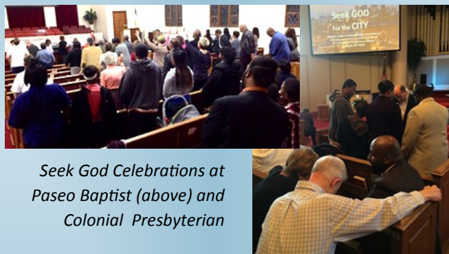
Seek God Celebrations at Paseo Baptist (above) and Colonial Presbyterian

In all, 51 churches responded and we purchased and distributed 6,200 prayer guides across the city. TOGETHER we prayed 40 days from Lent to Palm Sunday. These prayers were very impacting and we concluded the journey with two Celebration Prayer Worship gatherings at Paseo Baptist and Colonial Presbyterian on Wornall. This was an extraordinary season of prayer!!!