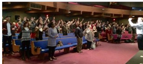
Speaking at 24-7 Prayer North America and consulting with Young Emerging 24-7 Leaders

I have been invited to serve on two national teams: City Advance and the 24-7 Prayer North America Team. I have been invited to speak to national and city leaders at two recent conferences held in Portland, OR. I am basically sharing the local KC story with our values and mission. You are a part of this amazing God-Story! Thank you for your prayers and involvement.