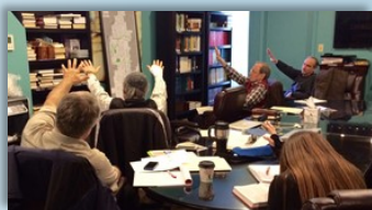
Overland Park Village Fire

We currently have 11 village fire gatherings across the metro where pastors and leaders gather frequently each month to deepen friendships across denominational and racial barriers, we pray fervently for our communities and the nation, and we find every way possible to collaborate and partner in mission! We are launching our 12 th village fire this Spring in the south Kansas City area. This new village fire will be involved in serving the Center School District and reaching out to families in need in that local area. Pray for US!