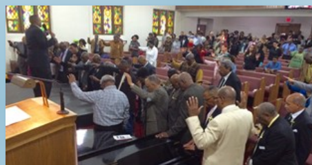
Paseo Culture of Prayer Commissioning of Leaders

There is a measurable longing in the hearts of numerous pastors and leaders for their ministry to become an authentic house of prayer. We have developed resources and a pathway for these leaders to take their teams on a journey into deepening prayer called the Culture of Prayer Church or Ministry. We have had a wonderful response from groups who are on the journey with us. These past few months we have served leadership teams from Paseo Baptist Church, Indian Creek Community Church and the Sending Project. God is doing a wonderful work in the hearts of these ministries.