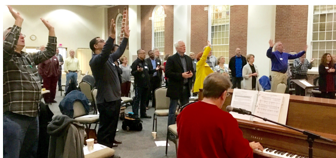
Prayer for Kids/Schools at Colonial Presbyterian

CPM and Caring for Kids partnered together to host a powerful citywide prayer gathering focused on prayer for under-resourced kids and schools in our city. We prayed fervently for schools, superintendents, principals, teachers and especially for kids in poverty and the challenges they face. We will be hosting a PRAY FOR KIDS SUNDAY this coming August to mobilize fervent prayer in Sunday morning services, along with prayer walking at schools, and an afternoon worship prayer rally.