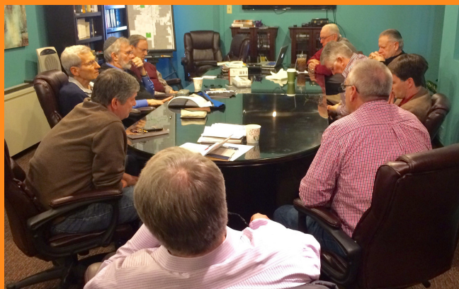
Overland Park Village Fire

We continue to faithfully serve our 12 village fire gatherings. God is doing a great work of deepening friendships across denominational and racial lines, releasing faith-filled prayer and collaborating TOGETHER in mission and service all across the city!